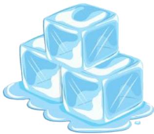
ice cube left out