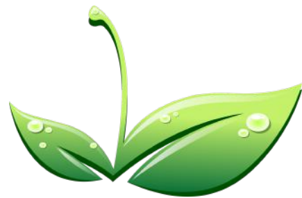
formation of dew drops